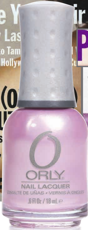
PRIM & PROPER FROM ORLY'S PREPSTER COLOR COLLECTION

AS SEEN IN ALLURE AUGUST 2009 orlybeauty.com