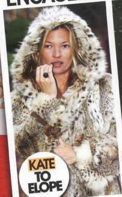
KATE TO ELOPE