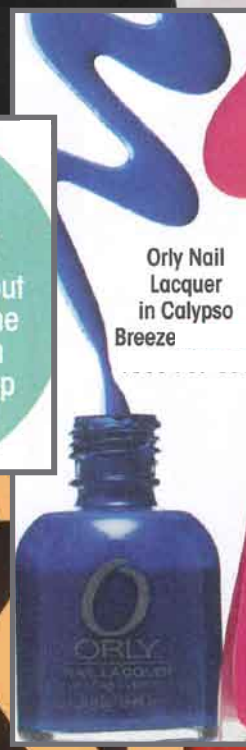
Orly Nail Lacquer in Calypso Breeze

Hottest colours This season is all about fun, bright shades. The colours look best on short nails – just keep it simple and bold!