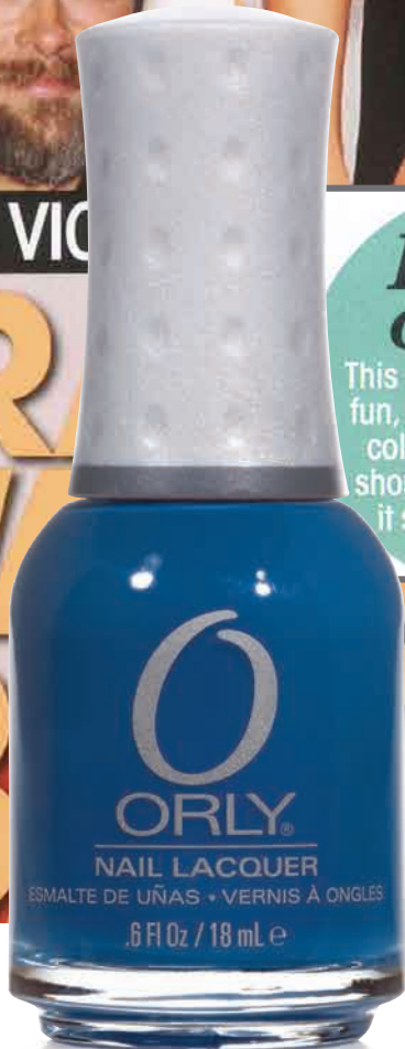
CALYPSO BREEZE FROM ORLY'S TIKI TIME COLOR COLLECTION

Hottest colours This season is all about fun, bright shades. The colours look best on short nails – just keep it simple and bold!