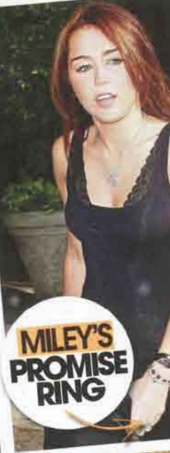
MILEY'S PROMISE RING