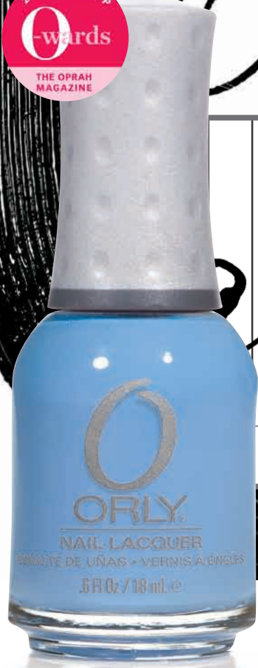
SNOWCONE FROM ORLY'S SWEET COLOR COLLECTION